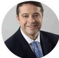
Minister Isaiah Diaz